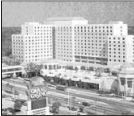
2003 Annual Meeting Biloxi, MS