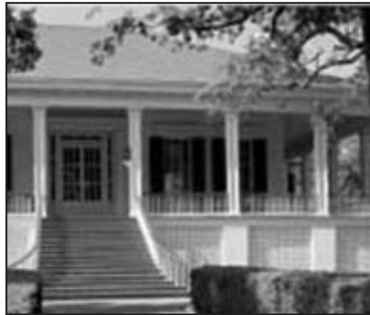
Father Ryan House