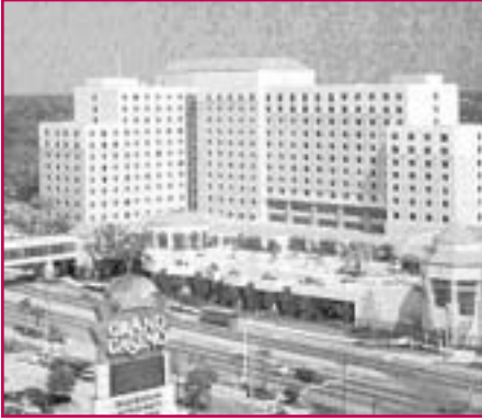
Grand Casino Biloxi 1-800-343-2450