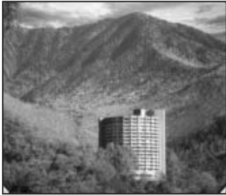
2004 Annual Meeting Gatlinburg, TN