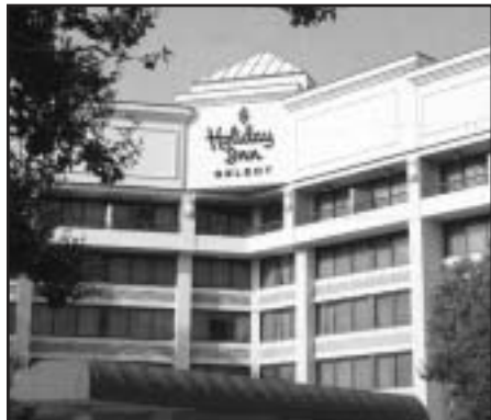
2005 Annual Meeting Baton Rouge, LA