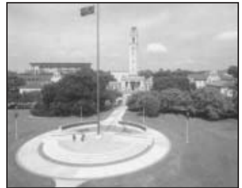
Louisiana State University