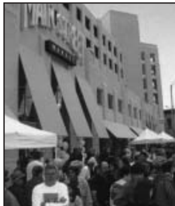
Main Street Market