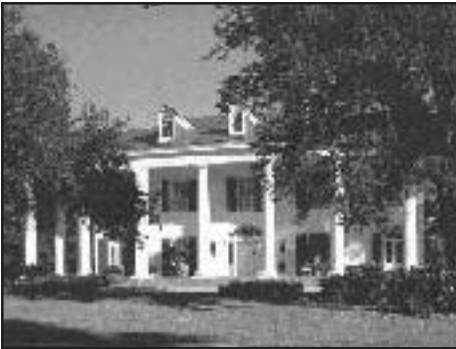
The Old Governor's Mansion