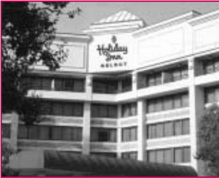
2005 Annual Meeting Holiday inn Select Baton Rouge, Louisiana