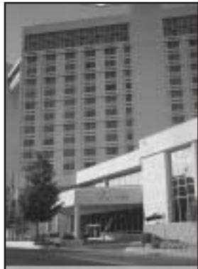
2007 Annual Meeting Hot Springs, Arkansas