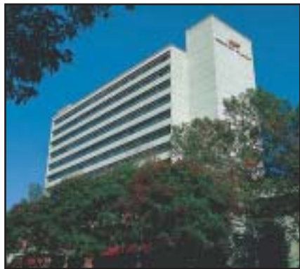
2008 Annual Meeting Knoxville, Tennessee