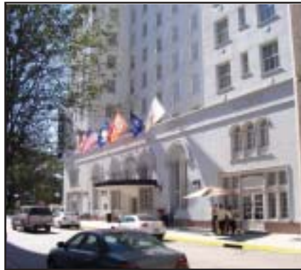
2009 Annual Meeting Baton Rouge, Louisiana

2009 Annual Meeting November 4-6, 2009 Hilton Hotel-Downtown Baton Rouge, LA